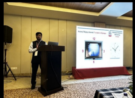
President speaks at Cuttack