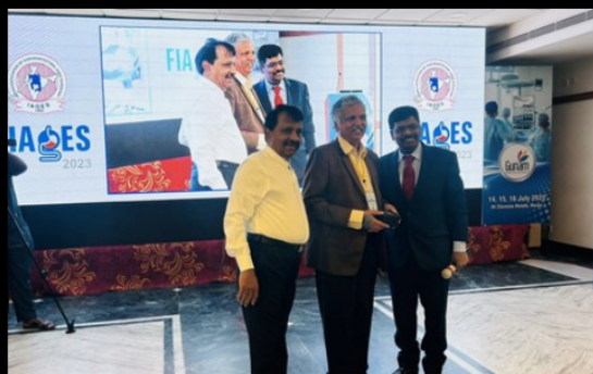
Core team Fals Hernia, Mumbai