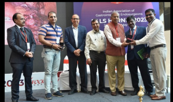
Felicitation of Armed Forces candidate Mumbai