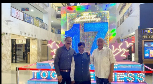
Core team Fals Hernia, Mumbai