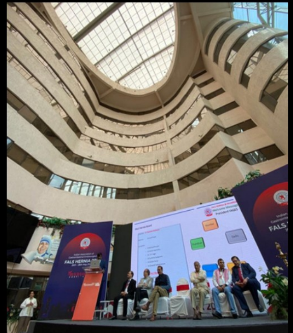
Auditorium at glance Mumbai