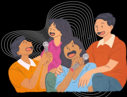
Tapping into your social connections.