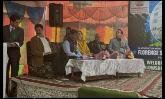
Inauguration ceremony at Srinagar Fiages