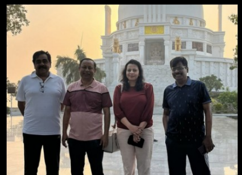
Budhhist temple visit