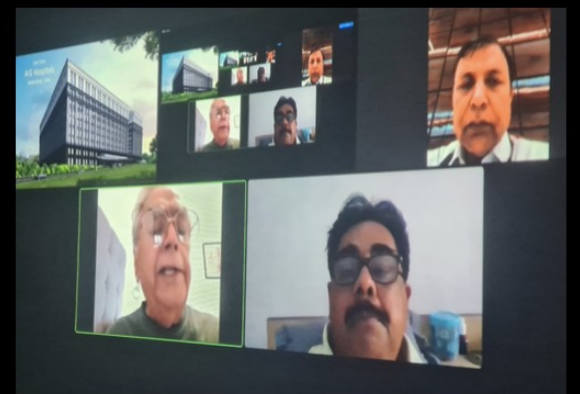
Moderators from across the globe, Erode