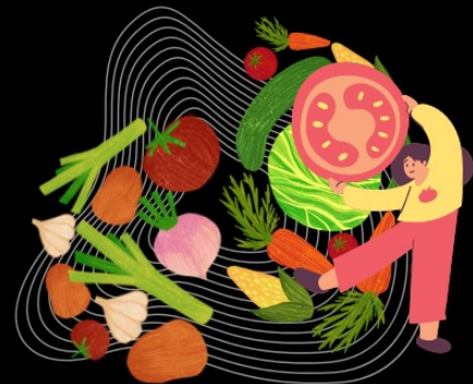
Eating a diet high in fruits and vegetables

American Heart Association (AHA) recommendations for physical activity – 30 minutes of moderate-intensity exercise five times a week or 25 minutes of vigorous-intensity exercise three times a week.