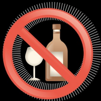
Avoiding alcohol /substance use