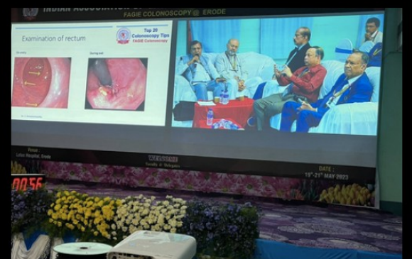
Complications of colonoscopy, Erode