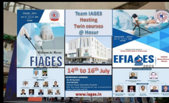
Welcome to the Hosur Twin program