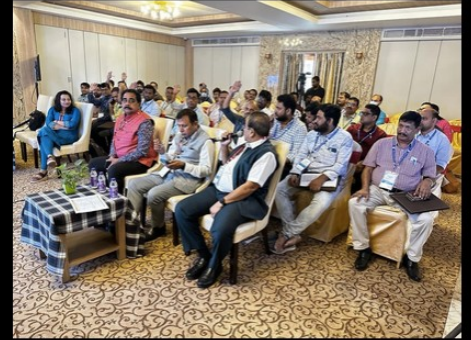
The delegates at Cuttack