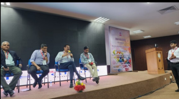
Bariatric panel discussion