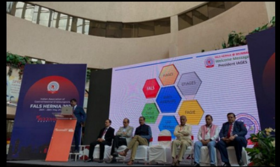
President sir's address Mumbai