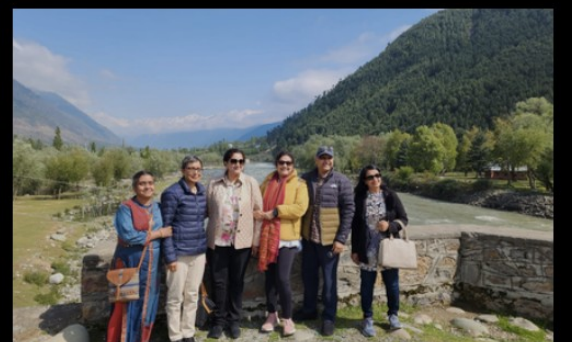
Faculty enjoying scenic Gulmark