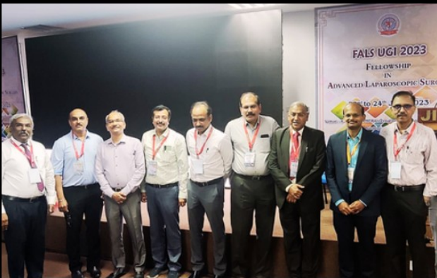
Faculty fals upper GI Jipmer