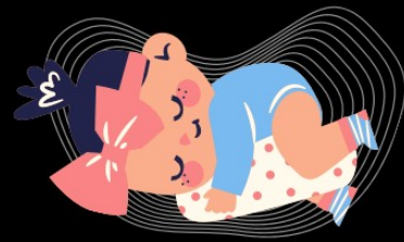
Getting a good night's sleep