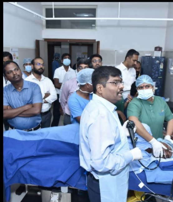
President sir demonstrating Endoscopy techniques