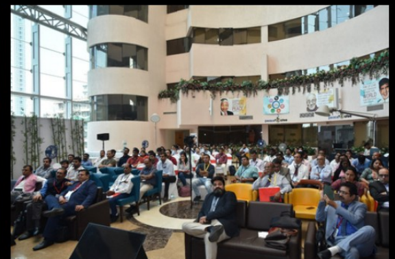
Excellent ambience in Glass Palace, Mumbai