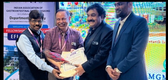
Faculty felicitation, Pondicherry