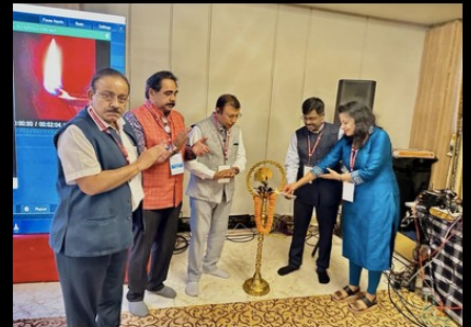
Inauguration ceremony at Cuttack