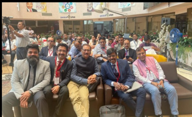
Faculty and Delegates, Mumbai