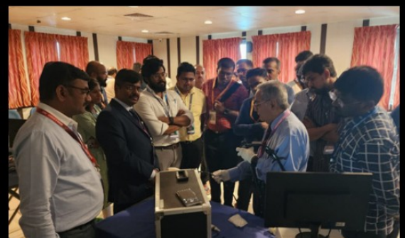
Delegates learning from BKR sir, Pondicherry