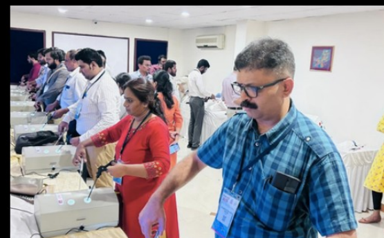
Delegates at the Endo- trainer Session